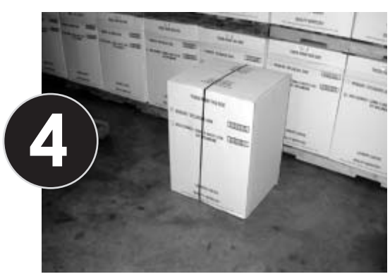
Band/Tape Boxed Machine Band or tape boxed machine to ensure that Styro piece can't be removed during shipment.