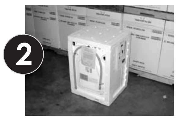
Install Styro Packing To install Styro Packing (provided). Top, bottom and all four corner pieces must be used to avoid fright damage.

ATTENTION! DO NOT over tighten transit screws! Damage to drum will occur! Screws should be snug, not tight.