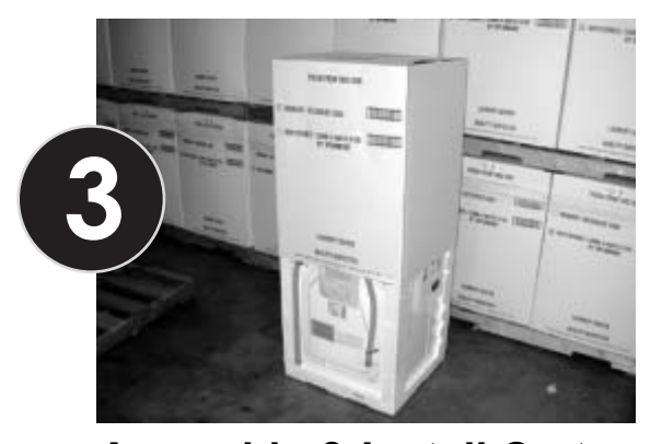
Assemble & Install Carton Assemble carton (provided). Slide it down over the top of the machine. NOTE: Open end of carton is at the bottom.