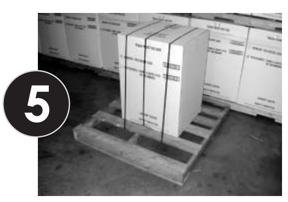
Band to Skid Band boxed machine to suitable pallet for protection against damage from any side during shipment.

Splendide Div. Westland Sales Corporate Headquarters 15650 SE 102nd Ave. Clackamas, OR 97015 - USA Phone: 503.655.2563 Fax: 503.656.8829 e-Mail: splendide@westlandsales.com Web: www.splendide.com